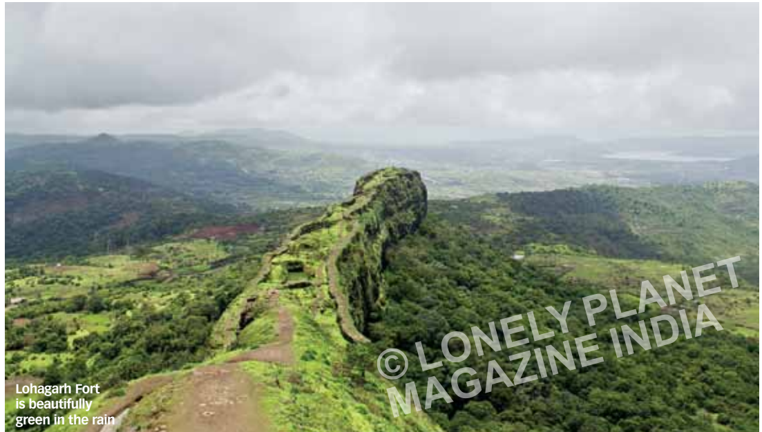
Lohagarh Fort is beautifully green in the rain

Breakfast and dinner are included in the tariff, lunch is provided at an extra charge (₹ 500 veg, ₹ 575 non-veg; prior notice required). There's also an a la carte snacks menu, or you could head into